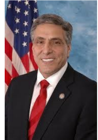
http://www.loubarletta.com/ Lou Barletta